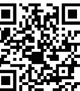
ZJU Degree Programs

Join Us, Solve the Greatest Challenges Together.