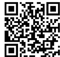
Dual Degree Programs

ZJU-UIUC Institute Facebook @ZJUuiucInstitute