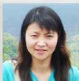
Chen Hong 陈红